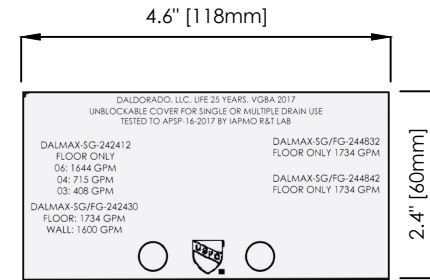
SPECIFICATION PLATE DETAIL

GRATING: 25 YEAR SERVICE LIFE/10 YEAR WARRANTY